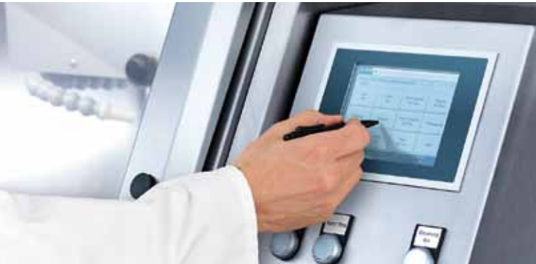
user-friendly touchscreen controls