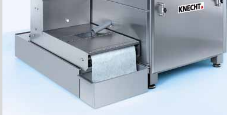
belt-filter coolant unit