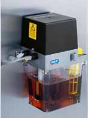
central lubricating system