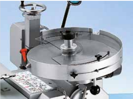
Changing the knife