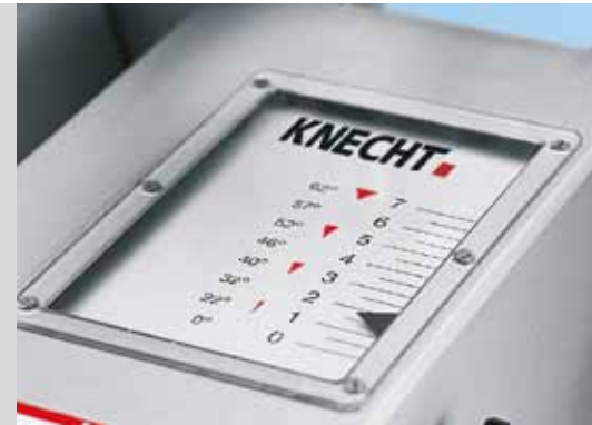
Adjusting the sharpening angle